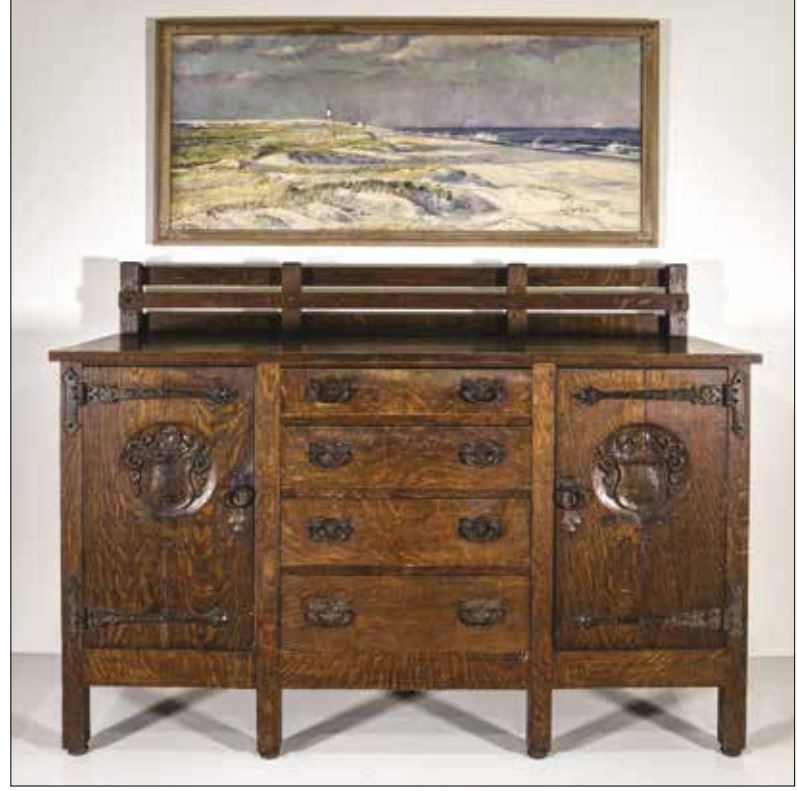
Fig. 9: Ethel Pennewill Brown Leach (1878–1959), Far View , before 1926. Oil on canvas, 29½ x 62½ inches. Museum purchase (2010.6); Sideboard, 1914, by Don Stephens (1887–1971). Oak, iron. Gift of the estate of Caroline Stephens Holt (2011.1.1).