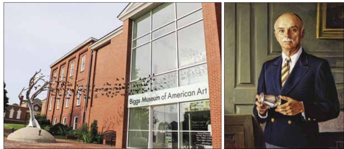
Fig. 1: The façade of the Biggs Museum of American Art, featuring its first permanent sculptural installation, Aloft (2015), by Erica Loustau, the capstone of the museum's 2011–2014 renovation.