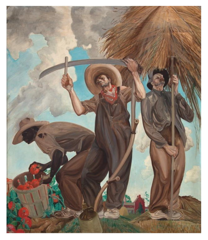
Summer, 1936, 8 x 9 feet, (old) Dover Post Office

William D. White portrayed the farmers as statuesque, Paul Bunyan-type figures, with oversized hands that work the earth to put