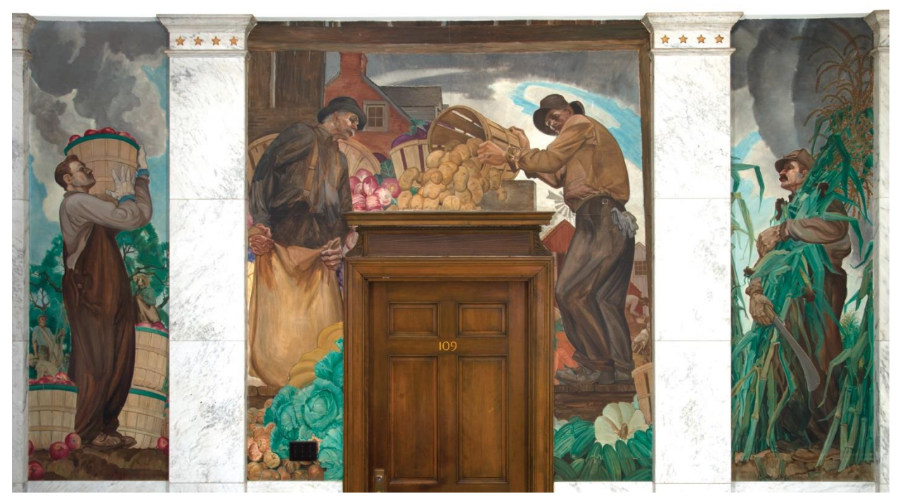
Harvest, 1936, oil on canvas applied to wall, Dover Post Office, now owned by Wesley United Methodist