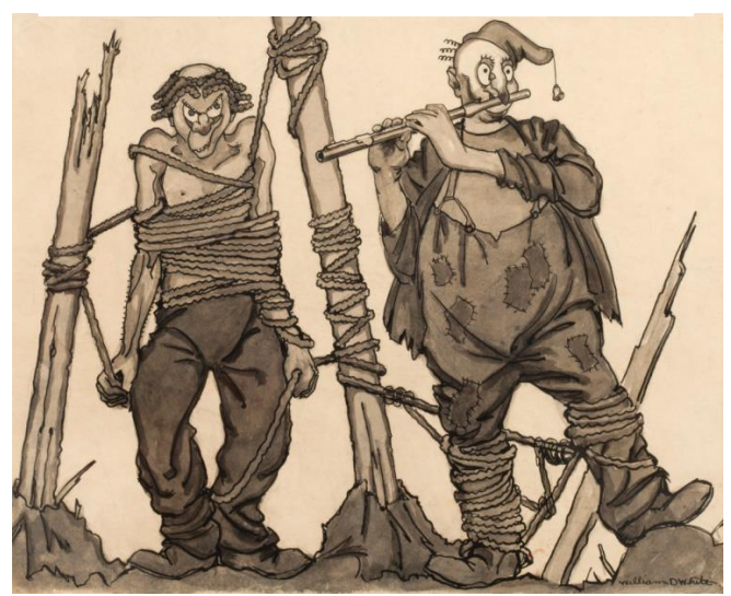
1776, c1935, pencil and ink on paper