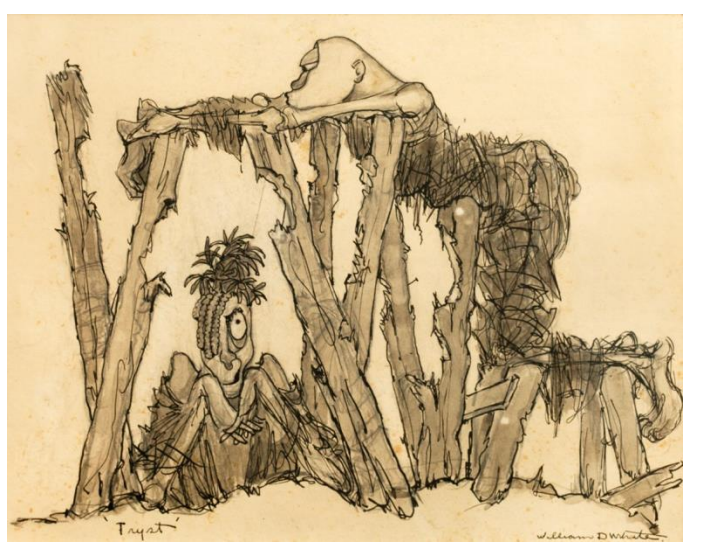
Tryst, c1935, pencil and ink on paper

Other drawings show figures bound with ropes, unable to move from their current places or circumstances. In You Bit Me , White may be commenting on President Roosevelt's famous fireside chat, where he promised that "in a land of vast resources no one should be permitted to starve." Meanwhile, millions of people nationwide relied upon soup kitchens sponsored by charitable organizations. In an overtly political cartoon titled 1776 , two tightly-bound characters parody Archibald M. Willard's patriotic Yankee Doodle 1776 , where fife and drum players lead