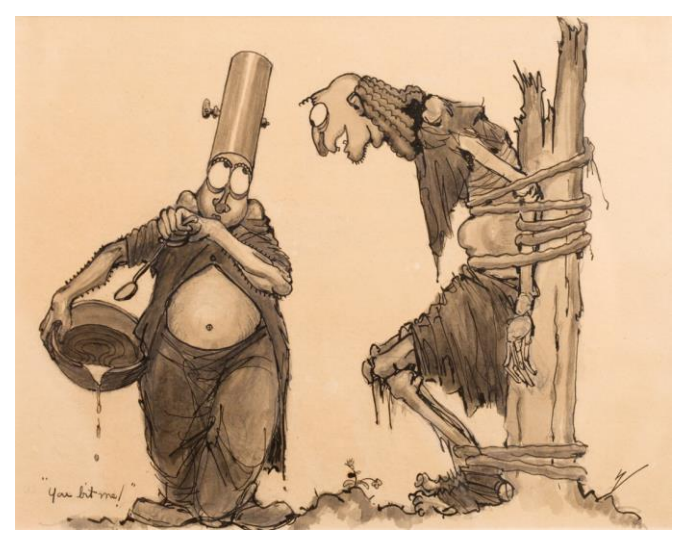
You Bit Me , c1935, pencil and ink on paper

Consistent themes and imagery characterized White's brand of social satire. He depicted apocalyptic scenes devoid of background context, where all of the symbols of society – homes, government buildings, churches, and schools – lay in ruin. He focuses our attention on the absurd plight of his characters. Consider News of the Day , for example. White draws a skeletal figure dressed in rags and leaning on a cracked cane. His body is bent into a gale force wind and his head is shrouded by a newspaper. The figure presses forward toward what, exactly, while the newspaper headlines shout "warnings, lies, murder, slaughter, fear, greed, air raid, ship chase, dead, ruin, and nuts."