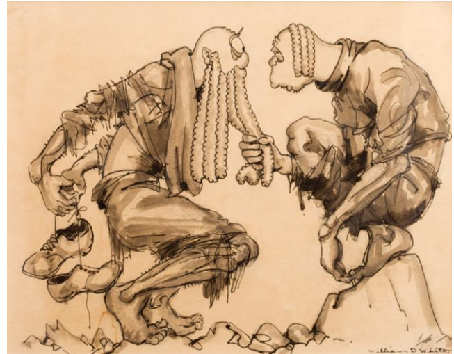
By the Aggies, c1935, pencil and ink on paper